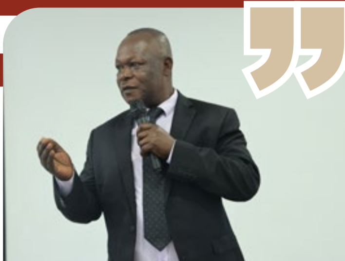
Chairperson of the Karamoja Chief Administrative Officers

"Local Economic Development should not be viewed as an initiative that depends solely on the availability of funds, but as a continuous strategy that requires commitment, coordination, and effective implementation. The knowledge shared during this workshop should translate into tangible actions that transform our communities. As we return to our respective Local Governments, we must assess the status of our local economies, fully operationalize the Local Economic Development and Investment Committees (LEDICs), and implement the resolutions agreed upon here. Karamoja is uniquely positioned for socio-economic transformation, supported by both the Regional Development Plan and District Development Plans, and we remain committed to working with the Ministry of Local Government to drive this agenda forward," said the Chairperson of the Karamoja Chief Administrative Officers and Chief Administrative Officer of Kabong District Local Government.