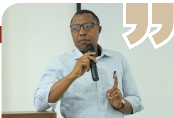
Mr. Namara Anthony, Commissioner for LED

"Local Economic Development should not be viewed as an initiative that depends solely on the availability of funds, but as a continuous strategy that requires commitment, coordination, and effective implementation. The knowledge shared during this workshop should translate into tangible actions that transform our communities. As we return to our respective Local Governments, we must assess the status of our local economies, fully operationalize the Local Economic Development and Investment Committees (LEDICs), and implement the resolutions agreed upon here. Karamoja is uniquely positioned for socio-economic transformation, supported by both the Regional Development Plan and District Development Plans, and we remain committed to working with the Ministry of Local Government to drive this agenda forward," said the Chairperson of the Karamoja Chief Administrative Officers and Chief Administrative Officer of Kabong District Local Government.